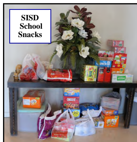
SISD School Snacks